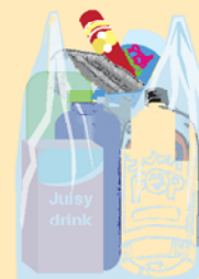
plastic shopping bags