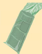
plastic newspaper delivery bags