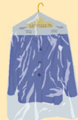
plastic dry cleaning bags